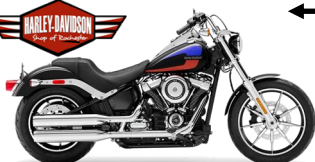
2020 Harley Davidson FXLR Low Rider Motorcycle