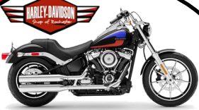
2020 Harley-Davidson FXLR Low Rider Motorcycle