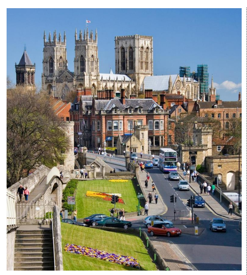
10 Days • 12 Meals : 8 Breakfasts, 4 Dinners

HIGHLIGHTS... Edinburgh Castle, York, Chester, Choice on Tour: Caernarfon Castle or Caernarfon Walk, Betws-y-Coed, Stratford-upon-Avon, Oxford, Choice on Tour: Ashmolean Museum or Oxford Walking Tour, London