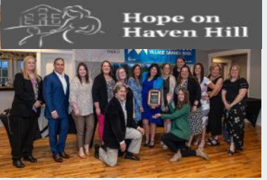
Hope on Haven Hill