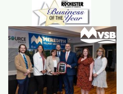
Meredith Village Savings Bank

Click on each image to see each awards recipient's video