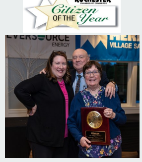
Hope on Haven Hill