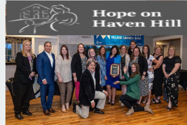
Hope on Haven Hill