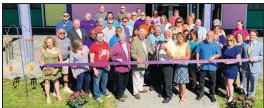
167 Dubois Road, Shokan, NY www.chimes.com