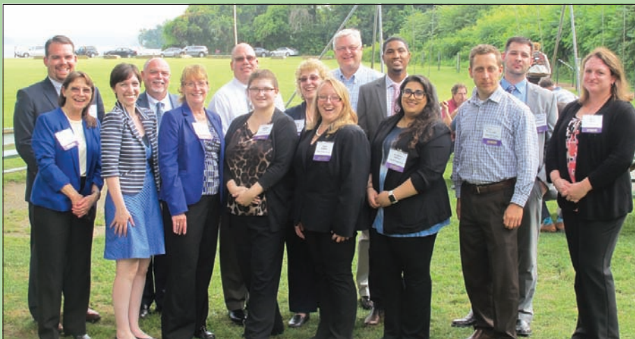
Our Mixer Sponsor The Bank of Greene County.