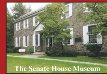
The Senate House Museum

PRSR STD U.S. POSTAGE PAID KINGSTON, NY 12401 PERMIT #39