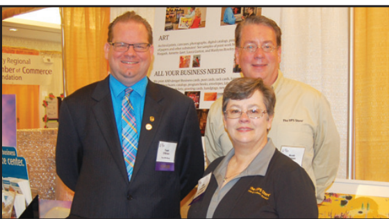
The UPS Store

PRSR STD U.S. POSTAGE PAID KINGSTON, NY 12401 PERMIT #39