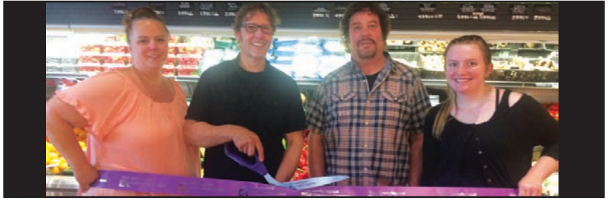
300 King's Mall Court, Kingston, NY www.motherearthstorehouse.com