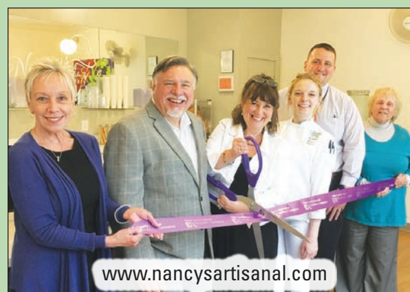
NANCY'S OF WOODSTOCK ARTISANAL CREAMERY: 105 Tinker St. Woodstock, NY