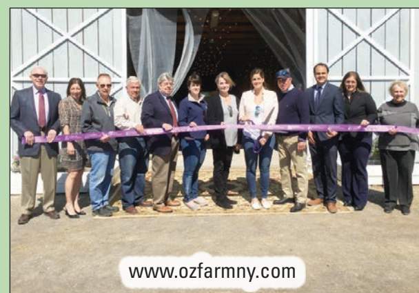
OZ FARM: 2890 Malden Turnpike Saugerties, NY