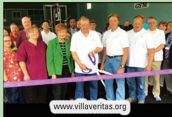
VILLA VERITAS FOUNDATION: 5 Ridgeview Road Kerhonkson, NY