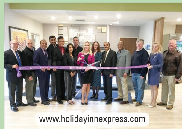
HOLIDAY INN EXPRESS & SUITES: 1834 Ulster Ave. Lake Katrine, NY