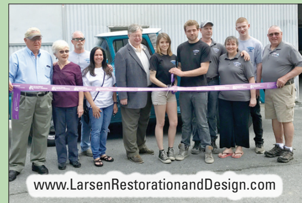
LARSEN RESTORATION AND DESIGN: 881 Flatbush Road Kingston, NY