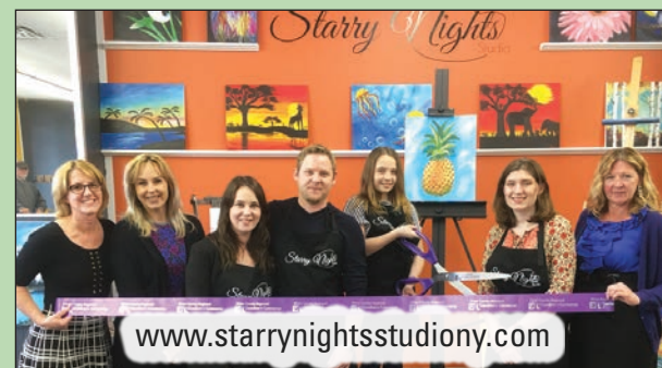
STARRY NIGHTS STUDIO: 1220B Ulster Ave. Kingston, NY