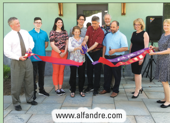
ALFANDRE ARCHITECTURE: 231 Main St. Suite 201 New Paltz, NY