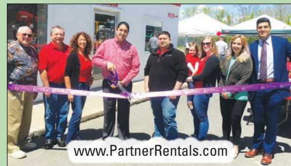
PARTNER RENTALS: 711 East Chester St. Kingston, NY