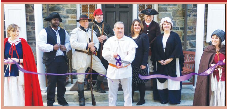
FRIENDS OF THE SENATE HOUSE: 296 Fair Street, Kingston • www.senatehousekingston.org