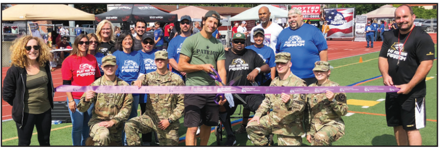
191 Dubois St., Newburgh, NY www.PlavForYourFreedom.org