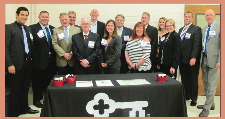
Our Mixer Sponsor, KeyBank