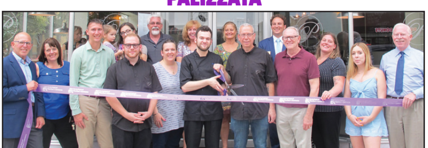
298 Wall Street, Kingston, NY www.Palizzata.com