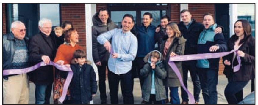
1220 Ulster Avenue, Town of Ulster, NY