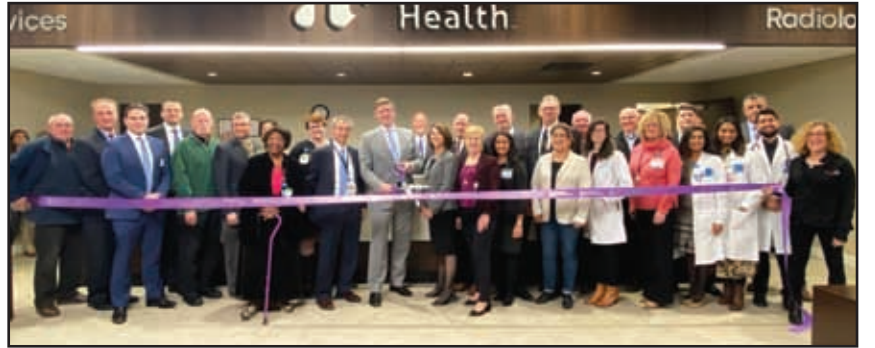
1240 Ulster Avenue (Hudson Valley Mall), Kingston, NY www.NuvanceHealth.org