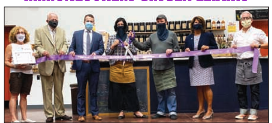
1776 Route 212, Saugerties, NY immune-schein.com