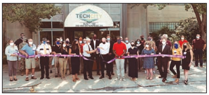
300 Enterprise Drive, Kingston, NY hvcvr.org