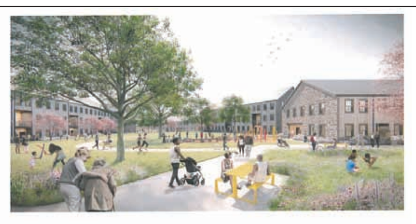
REQUEST FOR QUALFICATIONS FOR DEVELOPMENT INRTNERS COUNTY OF ULSTER - Housing Development Corporation Kingston, NY

Chamber Breakfasts are a great way to stay on top of current events. For more information, contact the Chamber at (845) 338-5100 or go online at www.UlsterChamber. org. Following CDC and Ulster County Health Guidelines, all attendees should wear masks until seated and may be asked to show proof of vaccination.