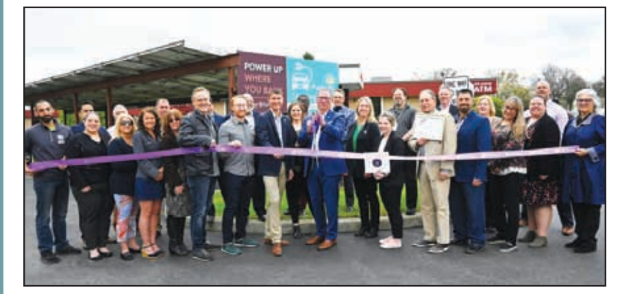
180 Schwenk Drive, Kingston NY www.ulstersavings.com