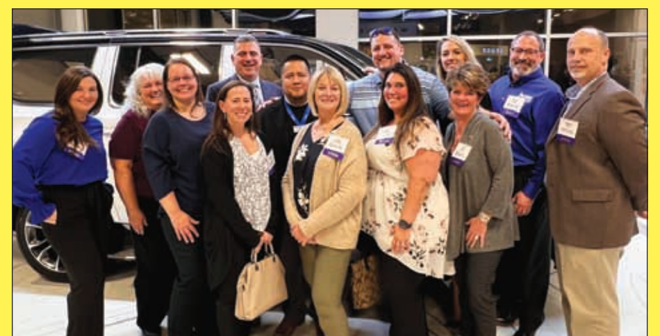
Our Mixer Sponsor, Mid-Hudson Valley Federal Credit Union.