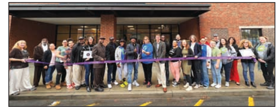
16 Cedar Street, Kingston, NY cce4me.org