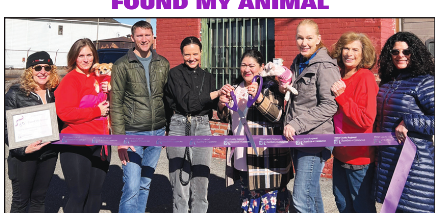
86 Smith Avenue, Kingston, NY www.foundmyanimal.com