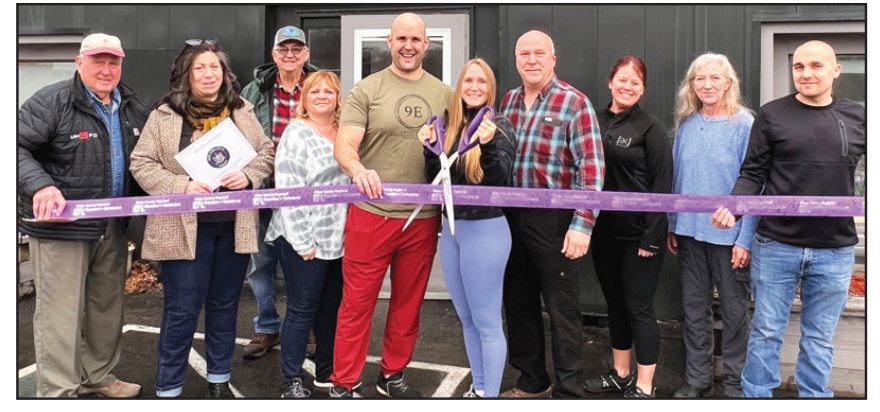
858 Route 212, Saugerties NY www.9essentialspilatesandwellness.com