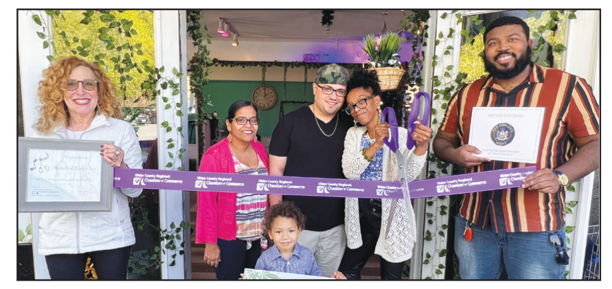
215 Main Street - Suite 11, New Paltz NY sites.google.com/rosebudentity.com/cbd