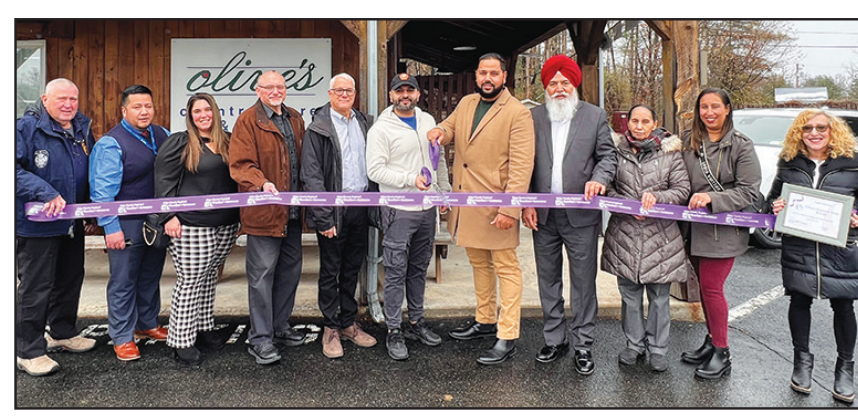
3110 Route 28, Shokan Square, Shokan NY olivescountrystoreandcafe.com