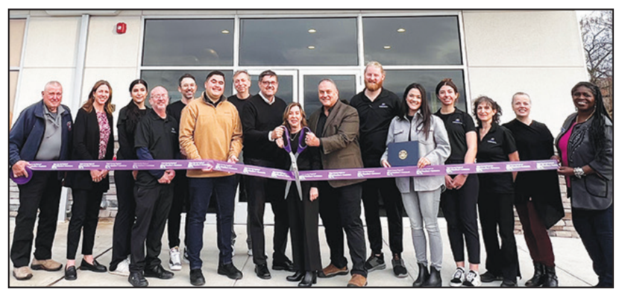
1204 Ulster Avenue - Suite 2, Kingston NY www.massageheights.com/kingston