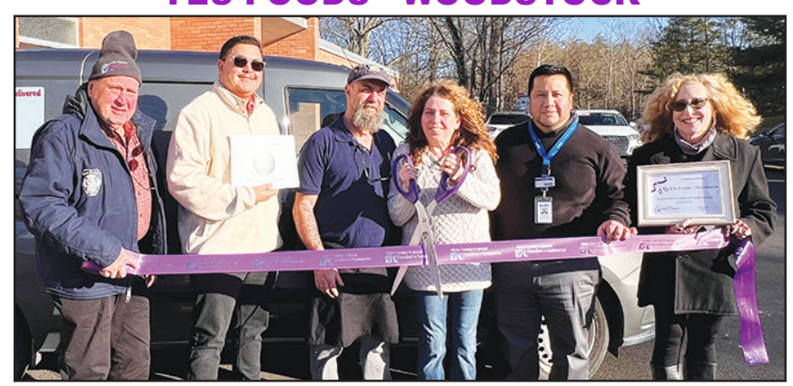
1700 Sawkill Road, Kingston NY www.yesfoodswoodstock.com