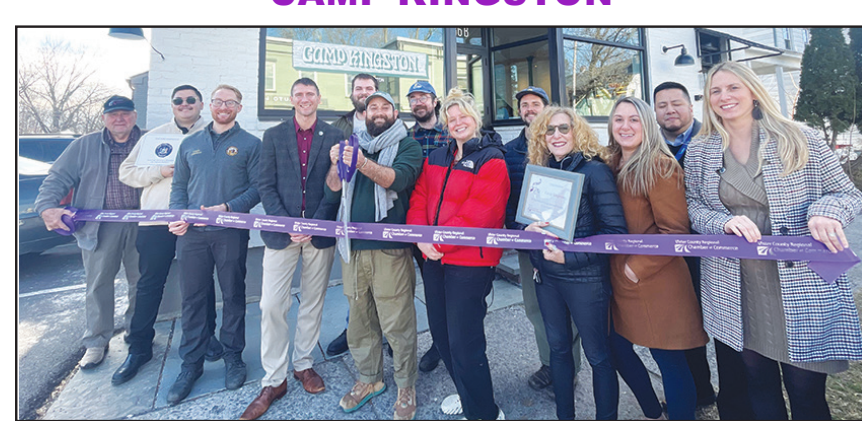
36 St. James Street, Kingston NY www.campkingston.com