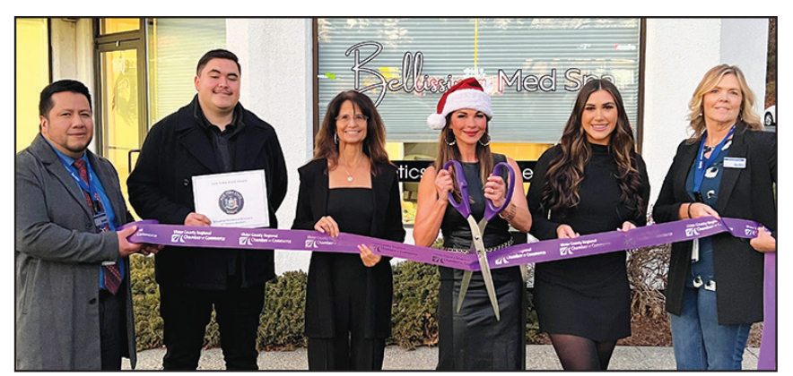
243 Main Street, Suite 160, New Paltz NY bellissimamedspahv.com