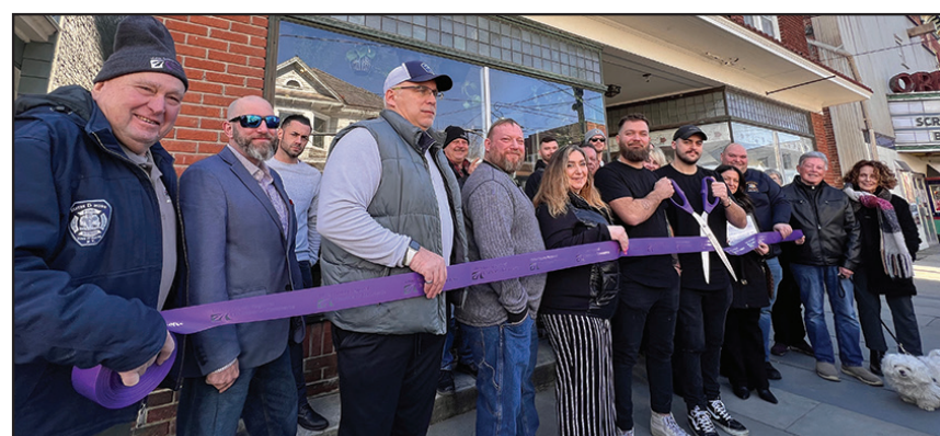
196 Main Street, Saugerties NY www.crownbarbershop.com