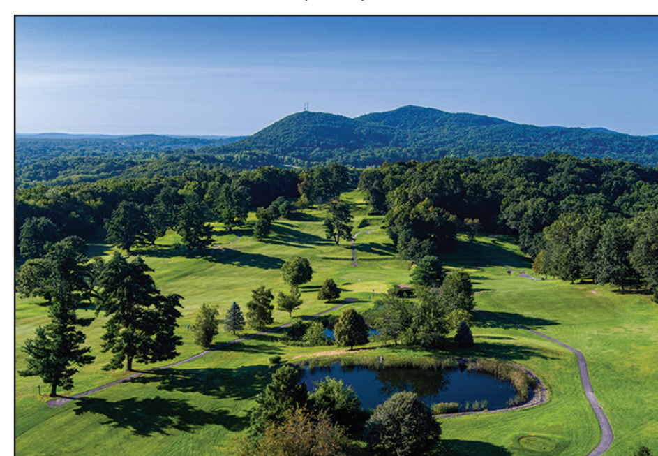
Twaalfskill Golf Club

fairways, bentgrass greens and four teeing areas to choose from.