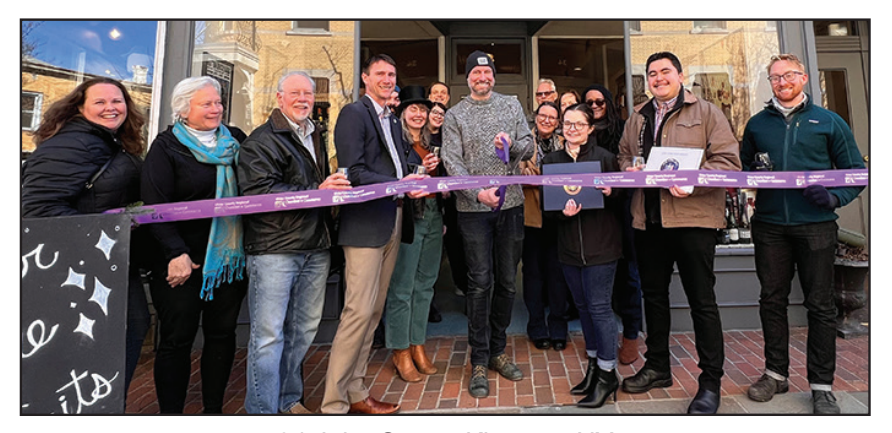
34 John Street, Kingston NY www.esterwine.com