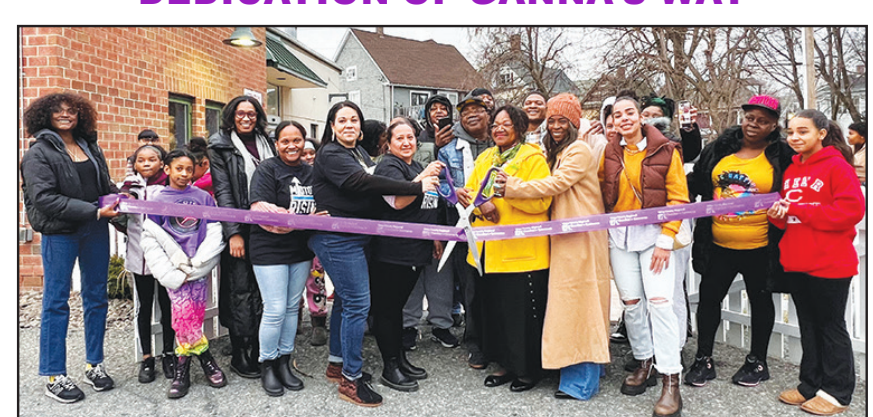
Broadway Bubble, 718 Broadway, Kingston NY