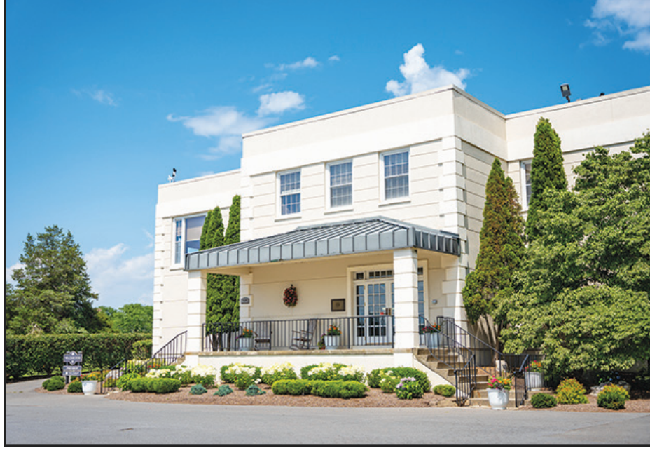
Wiltwyck Golf Club

Another option is Apple Greens Golf Course in Highland, a 27-hole championship golf course that offers some of the Hudson Valley's most spectacular views of the Shawangunk and Catskill Mountain ranges. The family-owned and operated enterprise opened in 1995 and gets extra stars for its manicured bluegrass