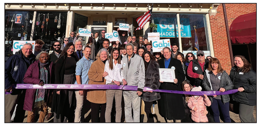
32 Broadway, Kingston NY www.gabimadden.com