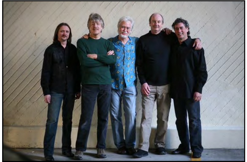
The Lovin' Spoonful