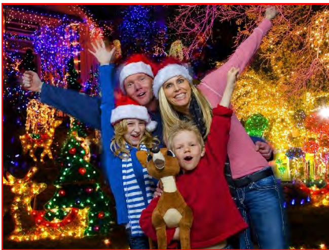
Six Flags' Holiday In The Park.

Park-goers will be transported to a magical winter wonderland featuring more than 50 rides, shows and attractions, roaming interactive holiday characters, storytelling with Mrs. Claus, warm and toasty fire pits, synchronized lighting displays, a breathtaking nightly snowfall and other holiday experiences that can only be experienced at Six Flags New England.