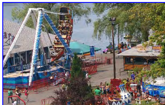
Lake Compounce (left) and Quassy Amusement & Waterpark to host Golden Ticket Awards.