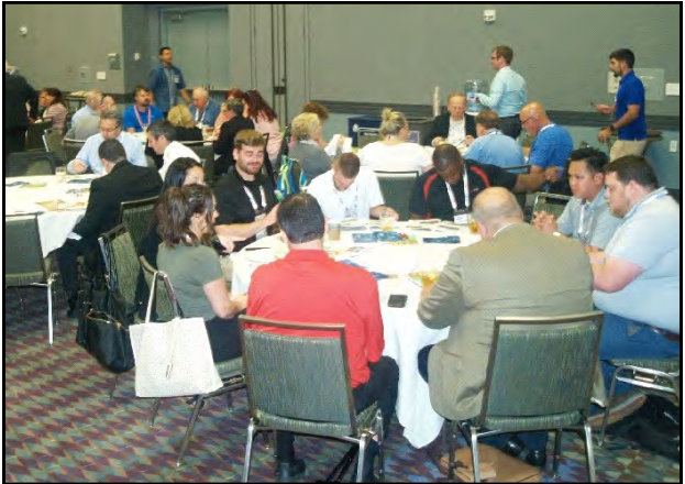
Always a good turnout (above) and a great lunch prepared by Centerplate (left).