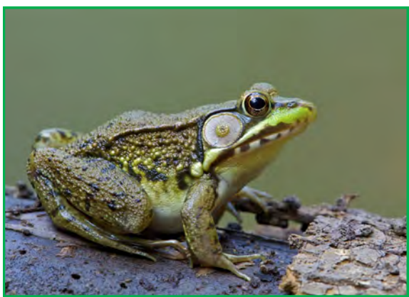
FrogWatch USA offered at zoo.

PROVIDENCE, R.I.— Amphibian species are disappearing at an alarming rate across the globe due to several factors such as habitat loss, pollution, and disease.