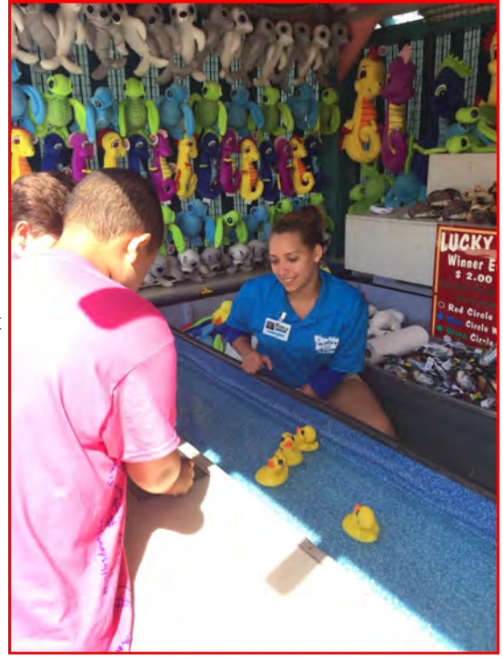
A SWT program student works a game stand at Funtown Splashtown USA in Saco, Maine

Although sponsors approve participants, individual visa applications can be denied. Some program cancelations due to visa denials or personal circumstances are to be expected. For this and other reasons, businesses must stay in regular communication with th