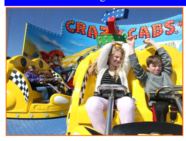
Crazy Cabs