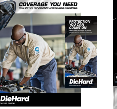
Countertop Display and Brochures