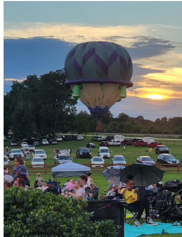
Peter Griswolds' Turtle Balloon offered rides while weather permitted at Butts Aglow.