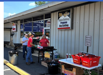
Jackson True Value Staff Grilling Hotdogs