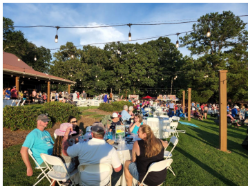
GleamPro crowd enjoying the event.