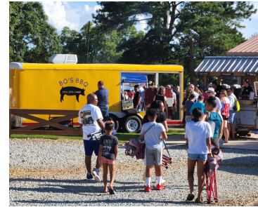
Butts Aglow featured several tasty food trucks with a variety of options this year.