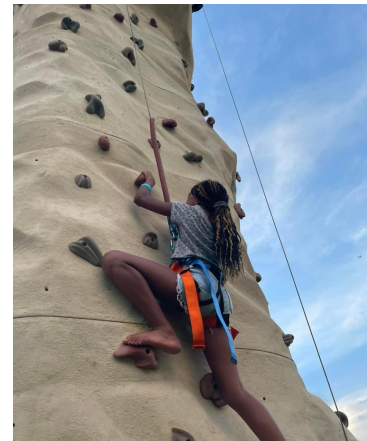
Rock climbing and carnival rides were some of the enjoyable activities at Butts Aglow.