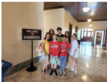
Stranger Things visitors to Hawkins.