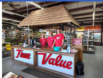
Jackson True Value Customer Appreciation Days