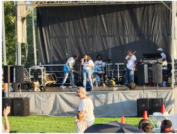
Atlanta's Band Contagious entertained event guests.