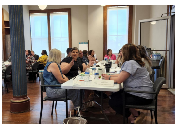
Leadership Class 2022-23 working on an assignment.