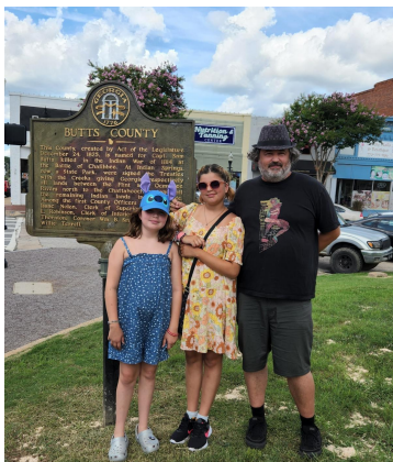
Stranger Things visitors from Montreal, Canada