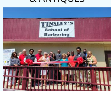
TINSLEY'S SCHOOL OF BARBERING