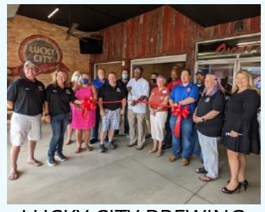
LUCKY CITY BREWING