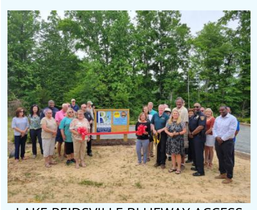
LAKE REIDSVILLE BLUEWAY ACCESS