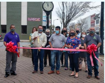
GARCIA FENCE INC.