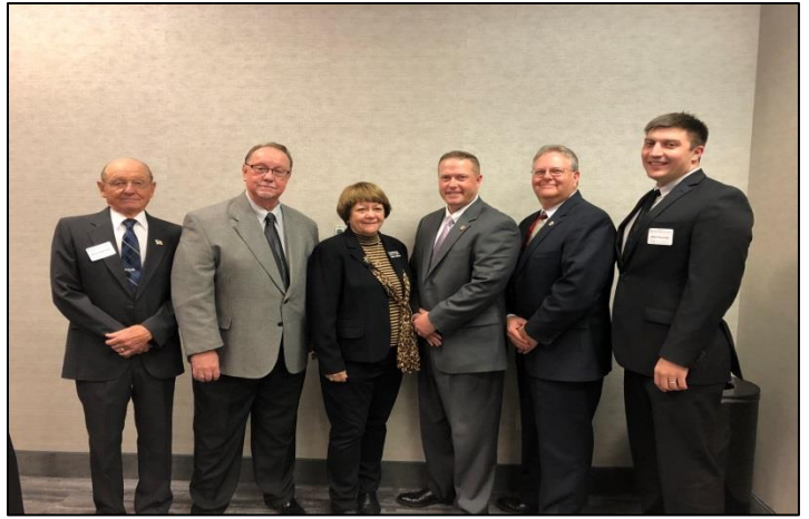
State of the Valley

Enhanced Web Listing .....$50 (one time fee)