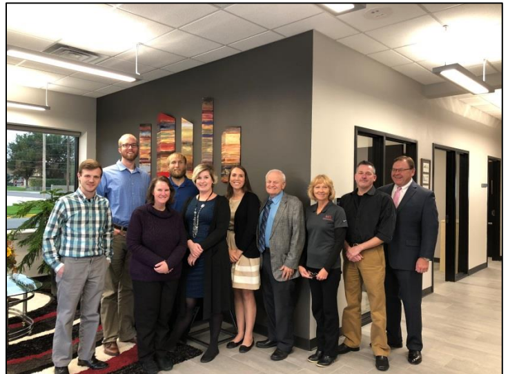
Business After Hours