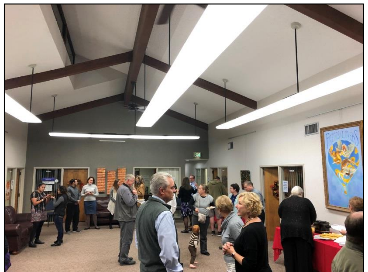
Networking opportunities year-round