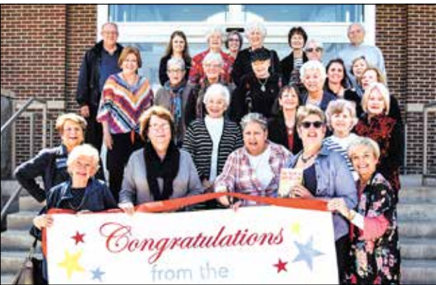
Announce 2018 County Read & Anniversary