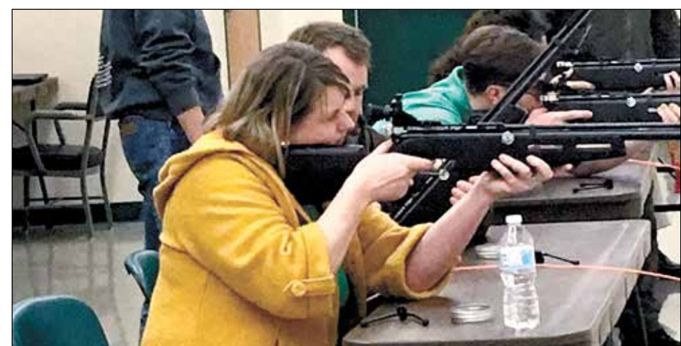
Students take aim at the Brenham High School ROTC shooting range.