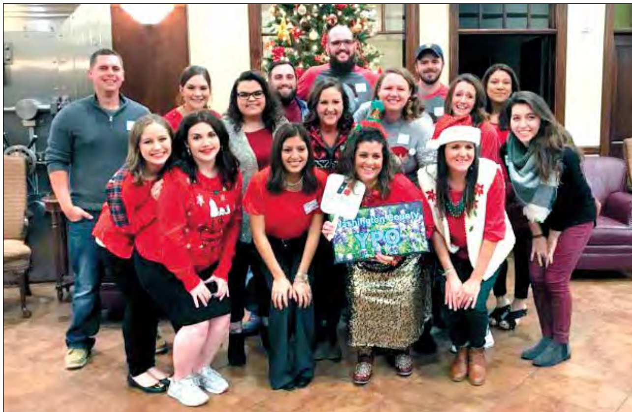
Members of the YPO held an Ugly Holiday Attire party in December at Bank of Brenham.

For more information about the Washington County YPO, send your contact information to youngpros@brenhamtexas.com or visit online: www.Facebook.com/YPOwashingtoncounty