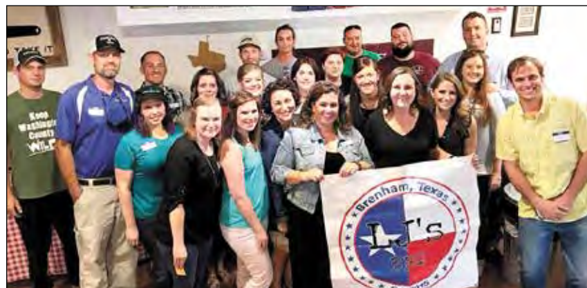
The Washington County YPO group holds a "Happy Hour" once a month in different locations around the county.

Corporate connections are important to every professional, whether you're interested in non-profit management, government agency work or launching a high-tech startup. Experts estimate that 60-80 percent of jobs are found through personal