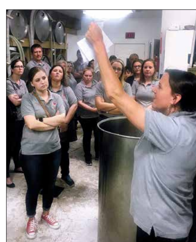
Visiting the cellar at Pleasant Hill Winery.