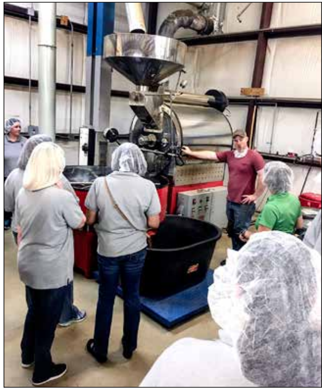
Class visits the Independence Coffee Roastery.