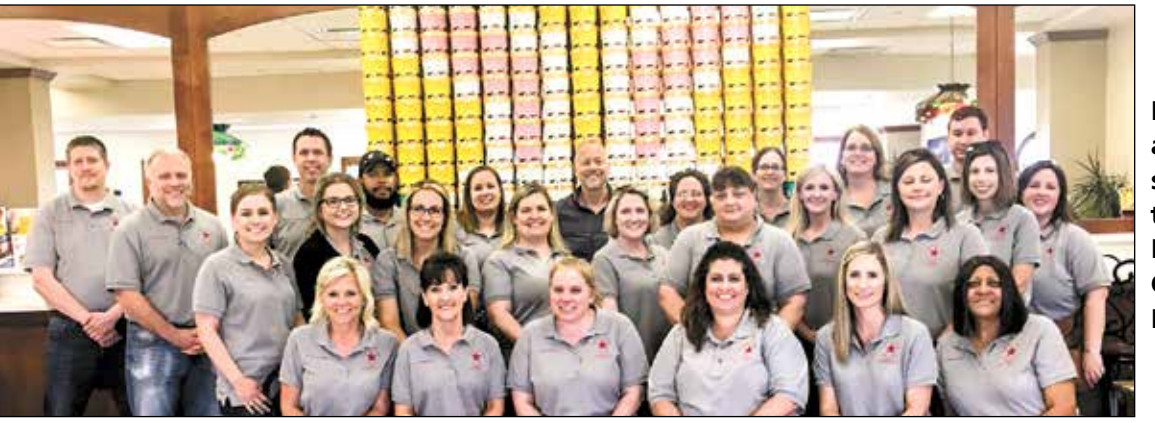
Enjoying a "sweet" stop in the Blue Bell Ice Cream Parlor.