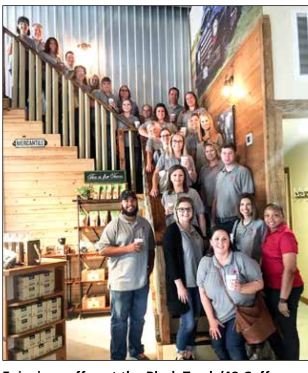
Enjoying coffee at the Black Truck '48 Coffee and Tea Room. They also serve lunch!