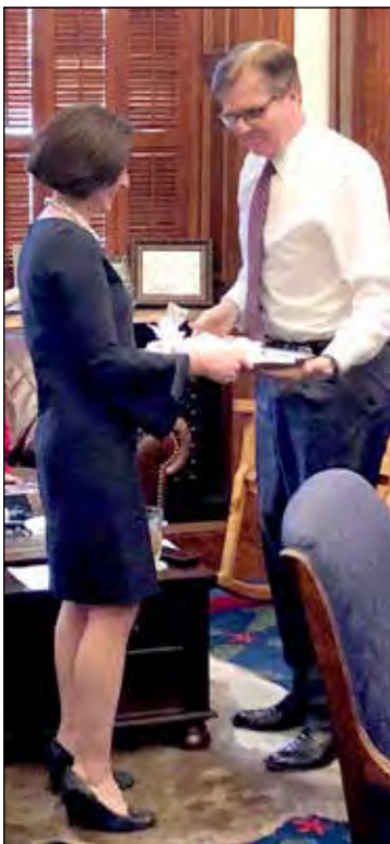
LEFT: Senator Kolkhorst and Rep. Leman serve Blue Bell Ice Cream in the Lt. Governor's reception room for the lawmakers and staff. RIGHT: Senator Kolkhorst brings a tray of Blue Bell to Lt. Governor Dan Patrick.