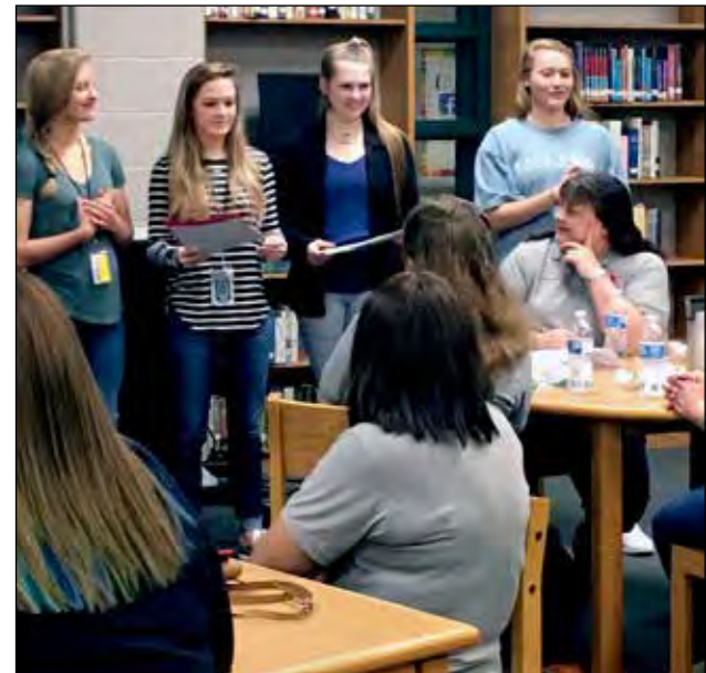
Brenham High PALs 2 students talk about the P.E.A.C.E. Program.