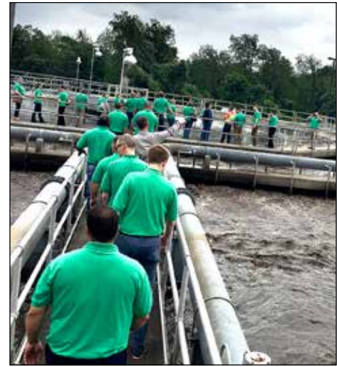
This is one bridge you don't want to fall off of.....