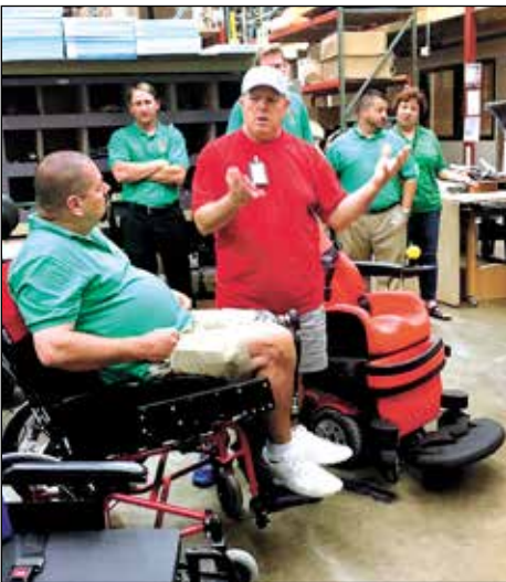
The wheelchair custom fabrication shop at BSSLC always "wows" visitors.