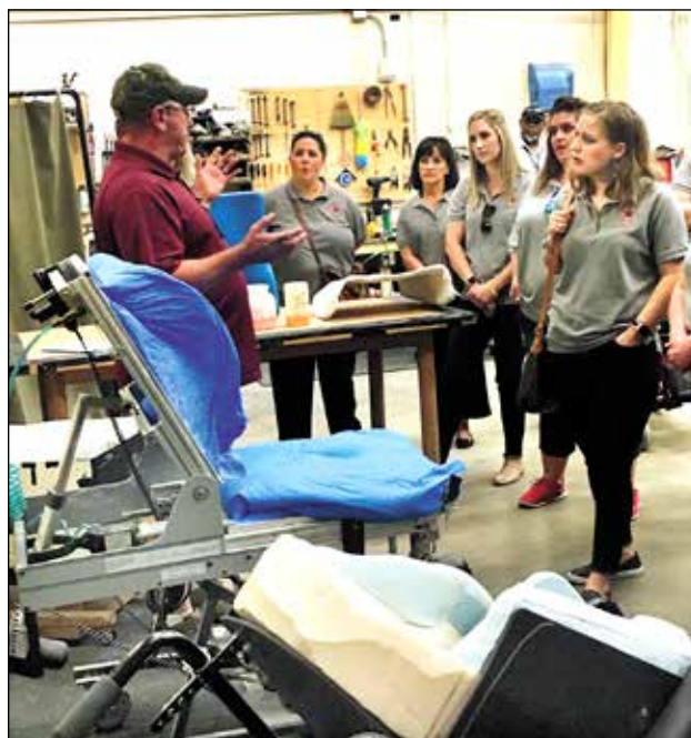
The wheelchair fabrication shop at BSSLC designs chairs to fit each individual resident.