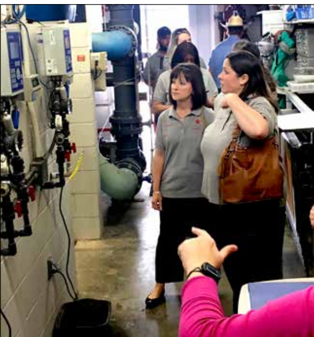
The class gets a closer look at the mechanical room of the BBAC.