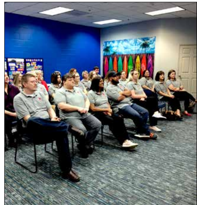
The class listens intently to the speakers in one of the meeting rooms at the BBAC.