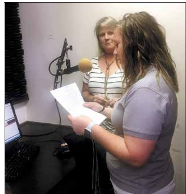
On the Air! Class members took turns recording ads for the station.