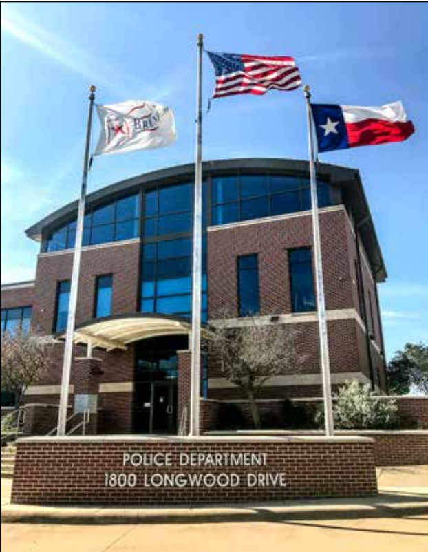
Brenham Police Department

The program runs from August to May each year. The next class will form in July 2020. Those interested are encouraged to call the Chamber office at (979) 836-3695. Details are posted on www.Brenham-Texas.com .