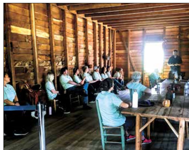
Inside Independence Hall at Washington on the Brazos, the class learned how Texas became Texas.