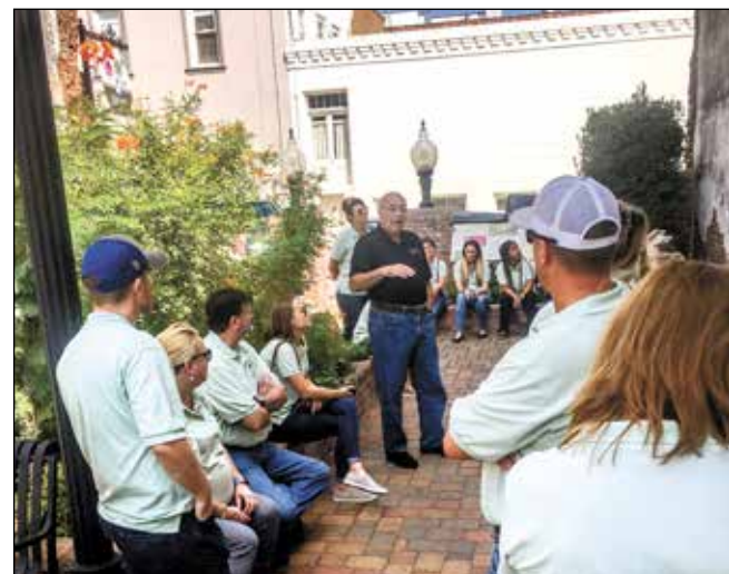
Toubin Park is a beautiful hidden gem in Downtown Brenham.