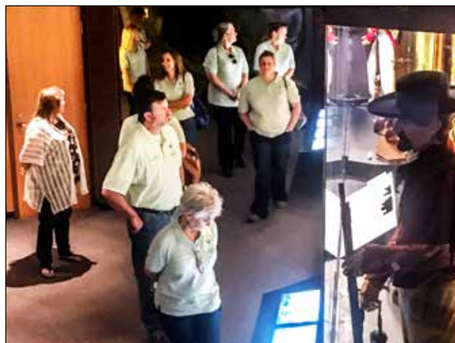
Many have never been to the Star of the Republic Museum, which is filled with displays on the history of Washington County and Texas.