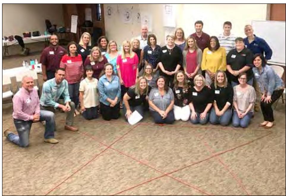
After untangling the rope, the group poses with their most perfect star.