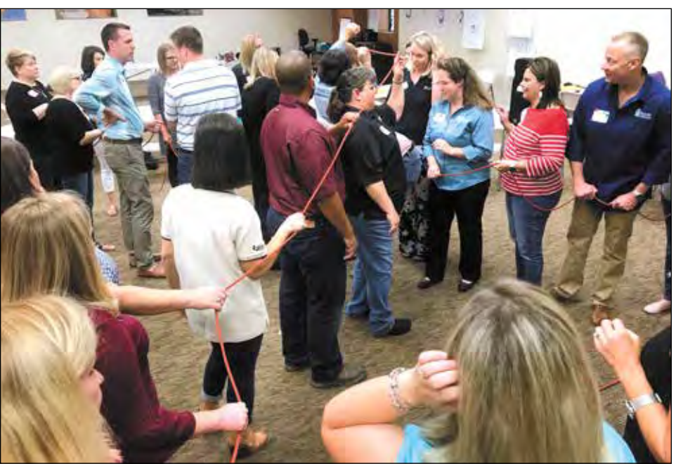
The class works together to try and untangle a rope knot.