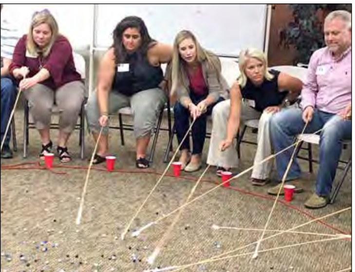
One of the activities that demonstrated giving and receiving help and knowledge through teamwork.