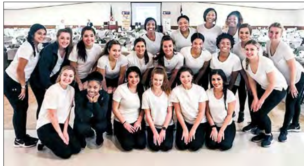
Members of the Blinn College Dance Team helped serve salad and drinks.