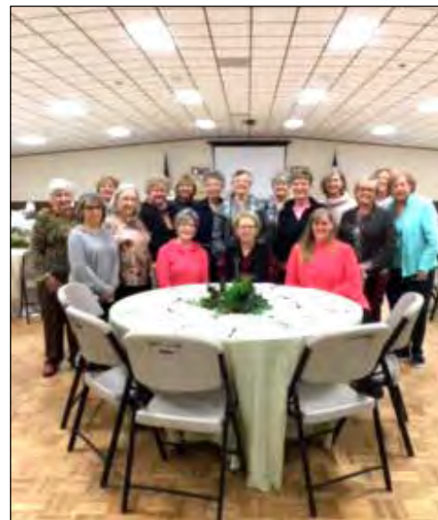
The Bluebonnet Garden Club always does a fabulous job decorating the tables each year.