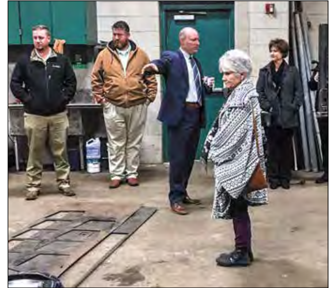
Brenham ISD CTE Director walks the class through one of the workshops at Brenham High School.