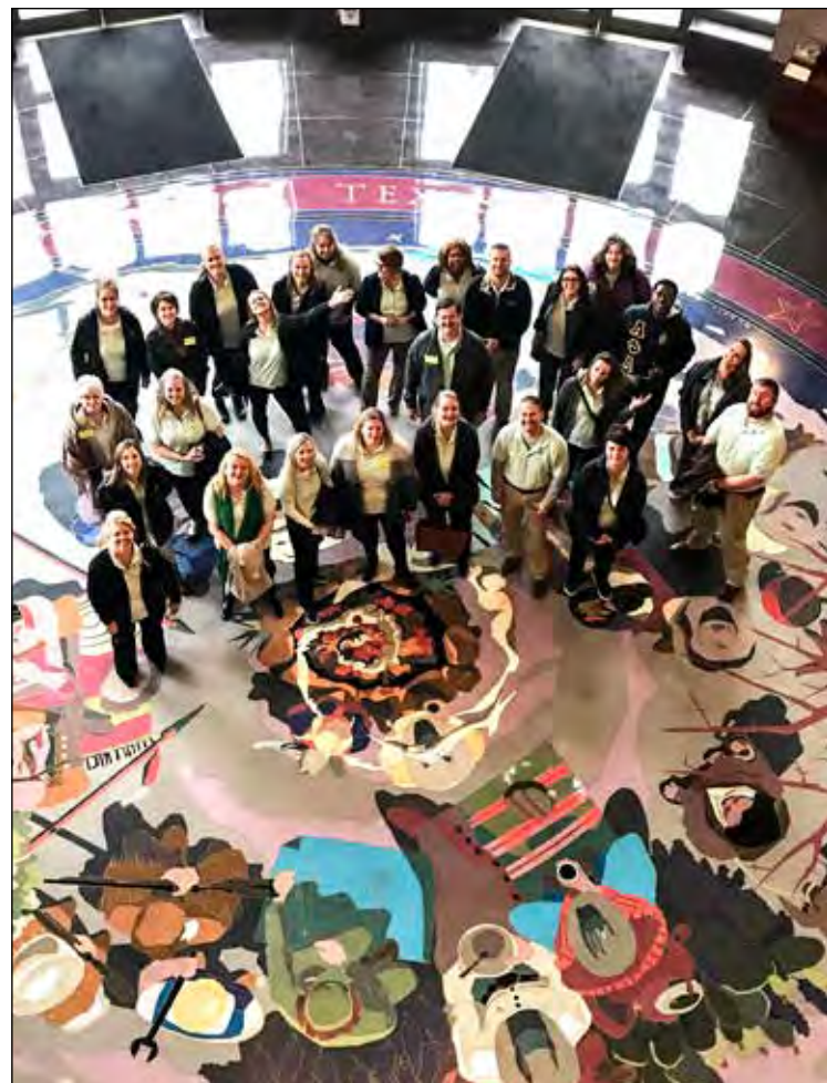
On the ornate floor of the Bob Bullock Museum.