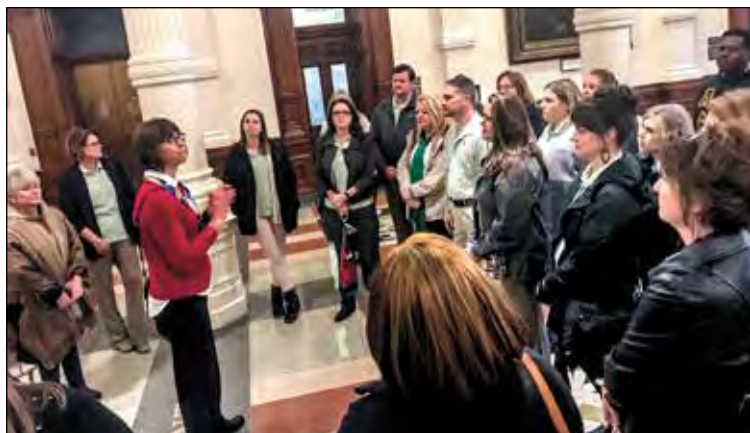
The class began their day with a guided tour.

After hearing from our Representatives, lunch was enjoyed in the Capitol Grill. The class then traveled to the Bob Bullock Texas State History Museum where they watched "The Star of Destiny" a multi-sensory film inside the Texas Spirit Theater.