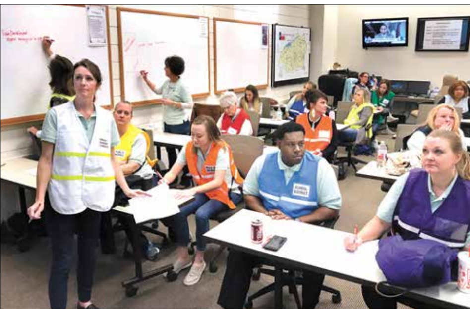
The class takes notes on a mock disaster that occurred in Brenham.