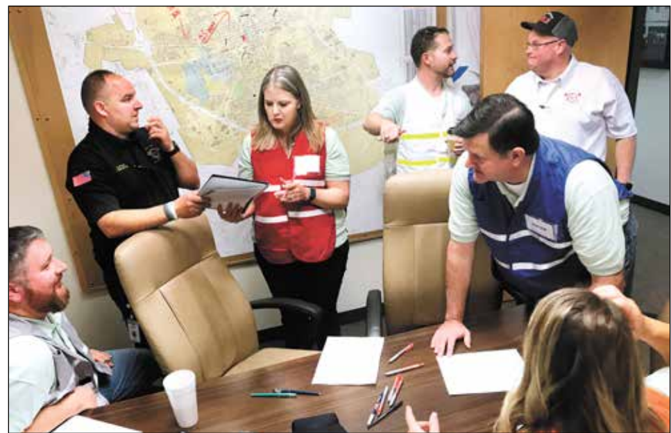
Executing a plan to keep the town safe.