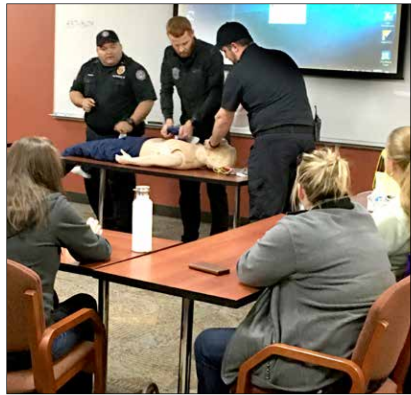
Paramedics demonstrate LUCAS on a mannequin.

Leadership Washington County is one of the key programs of the Washington County Chamber designed to train and motivate leaders for this community. The next class will form in July. For more details or to view the application form, visit the "Leadership" page on www.BrenhamTexas.com .