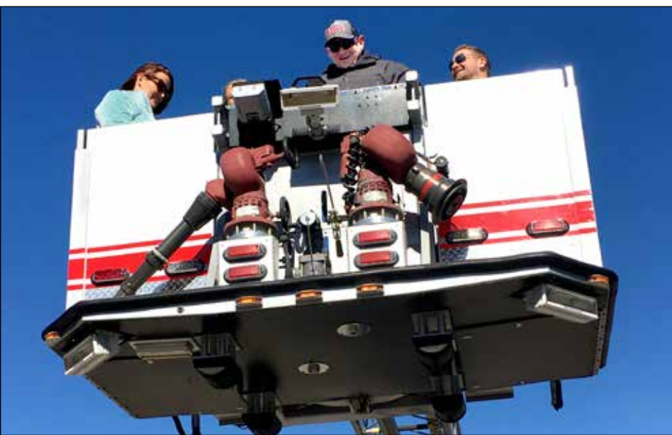
Participants get a view of Brenham from the BFD bucket ladder truck.