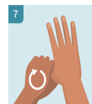
7 CLEAN THUMBS