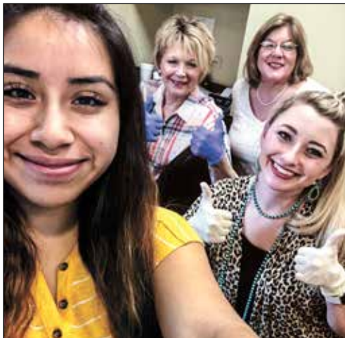
The tellers at Bank of Brenham are still assisting with their customers' financial needs. Most banks in the county are open to assist by appointment or have drive-thru options.