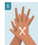
5 SCRUB BETWEEN YOUR FINGERS