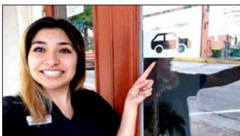
Padgett Hearing is also offering curbside services for their patients needing supplies. Appointments for in-office visits are also being taken. Medical care and medical supply offices around the county are still fulfilling their patients' needs.