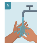
9 RINSE HANDS