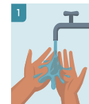
1 WET HANDS

HOW TO WASH YOUR HANDS PROTECT YOURSELF AND OTHERS AGAINST INFECTIONS