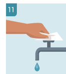
11 USE THE TOWEL TO TURN OFF THE FAUCET