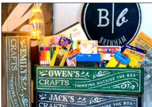
Board & Brush Brenham is offering pre-made projects & stocked Easter & activity boxes for curbside pickup. What a fun idea! Check with other retailers who may be doing the same!