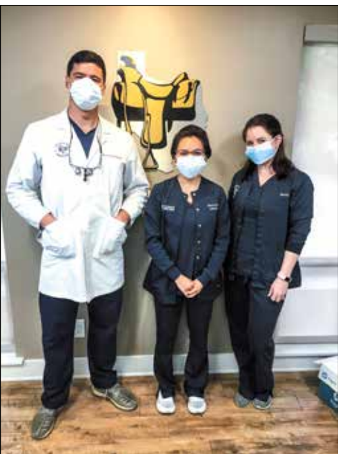
Local dental offices, like the Tippit Dental staff shown here at the Brenham location, are seeing patients by appointment.