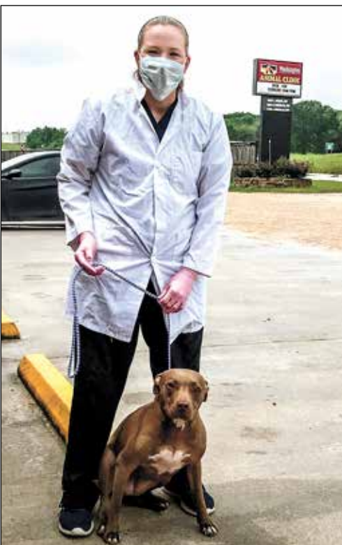
Most of the local veterinarians are offering curbside services like Washington Animal Clinic is shown here.