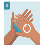
3 RUB HANDS PALM TO PALM