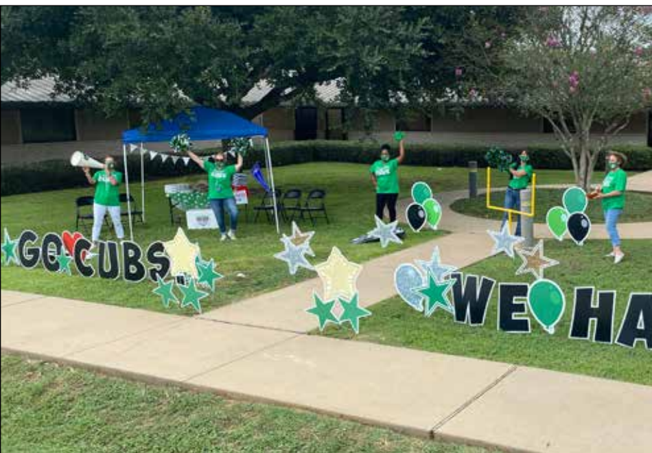
BEST THEME Personnel Services