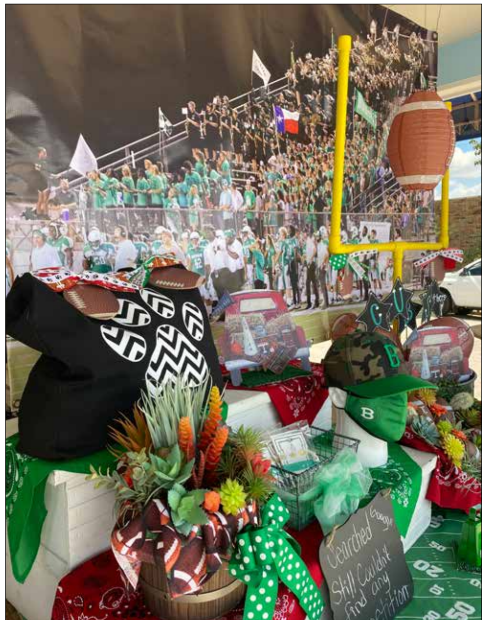
BEST WINDOW Pooltex American Inc.

E-messages are sent a maximum of once per quarter per member during each calendar year.