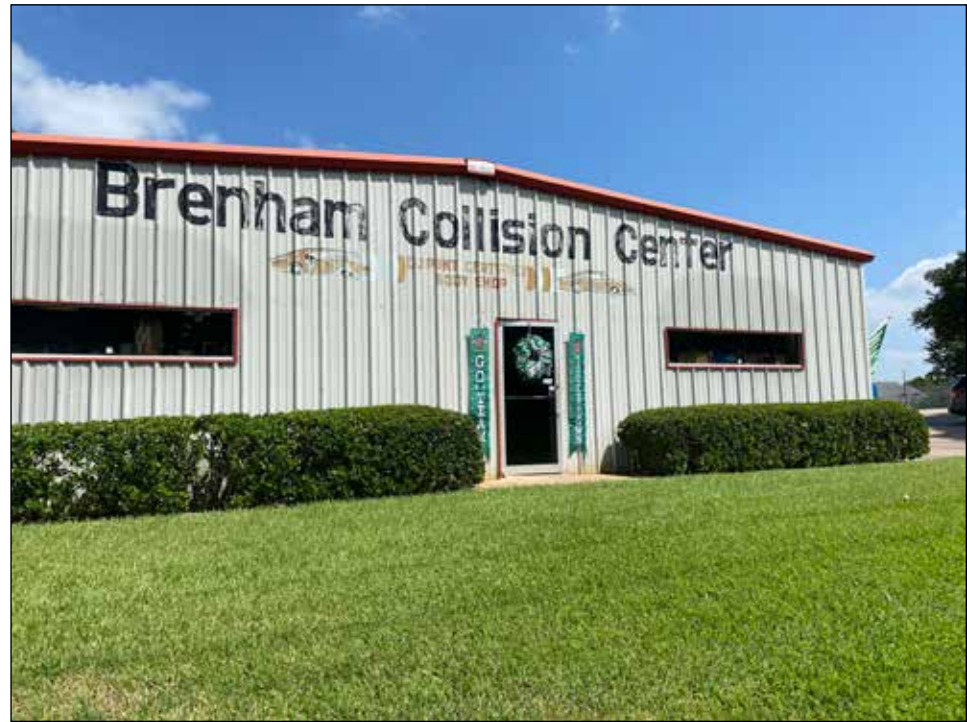
BEST DOOR Brenham Collision Center