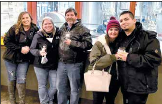
First Place team at the Feb. 11 Trivia competition.