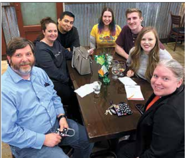
2nd Place team on March 4.