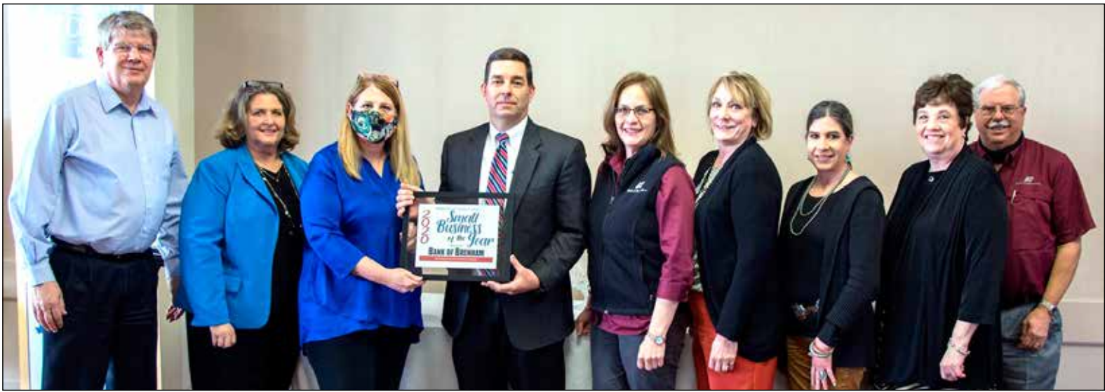
2020 Small Business of the Year with 26+ employees was presented to Bank of Brenham.

The two 2020 Small Business of the Year award winners also had members of their team at the luncheon. They are Must Be Heaven and Bank of Brenham.