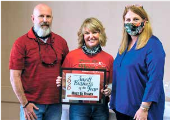
2020 Small Business of the Year with 25 or less employees was awarded to Must Be Heaven.