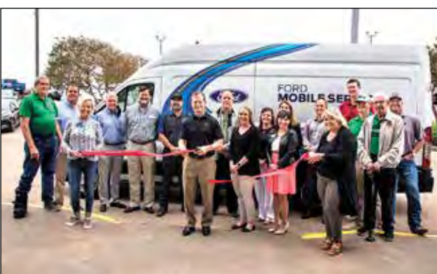
Business Expansion- New Mobile Service

Jerry Wilson Park, 900 East Alamo Street; Hattie Mae Flowers Park, 700 MLK Drive; Jackson Street Park, 1300 S. Jackson Street