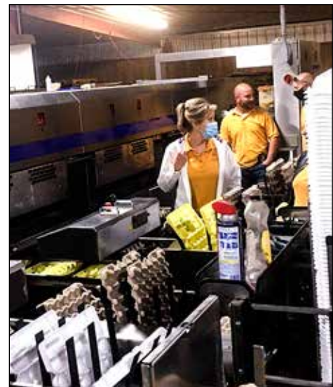
Seeing how eggs get from hen house to carton.