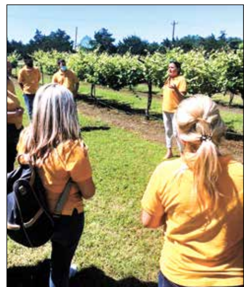
A tour to the vineyard on a beautiful day.