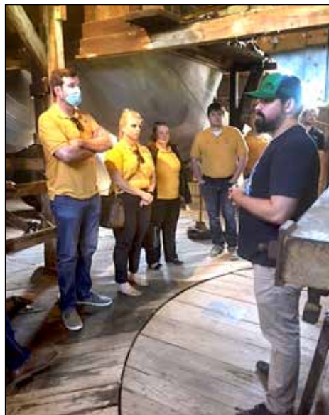
Inside the Cotton Gin