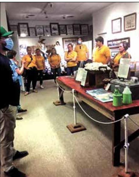
Inside the Cotton Gin Museum