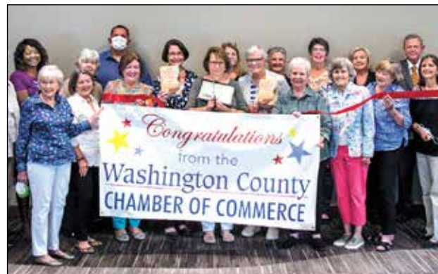
Announcement of the 2021 Read Book

Phone: 855-698-5465 2409 Longwood Drive, Brenham