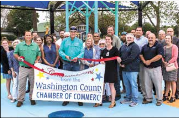
Celebration and Expansion