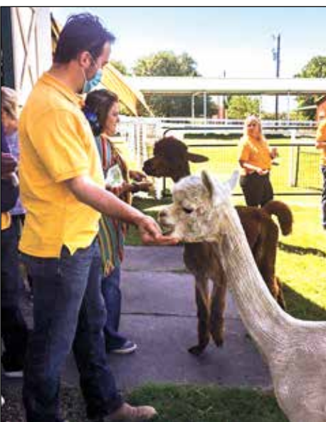
Feeding the alpacas at Peek a Ranch

Please contact Jane Hinze if you are interested in being a session facilitator for the 2021-22 program.