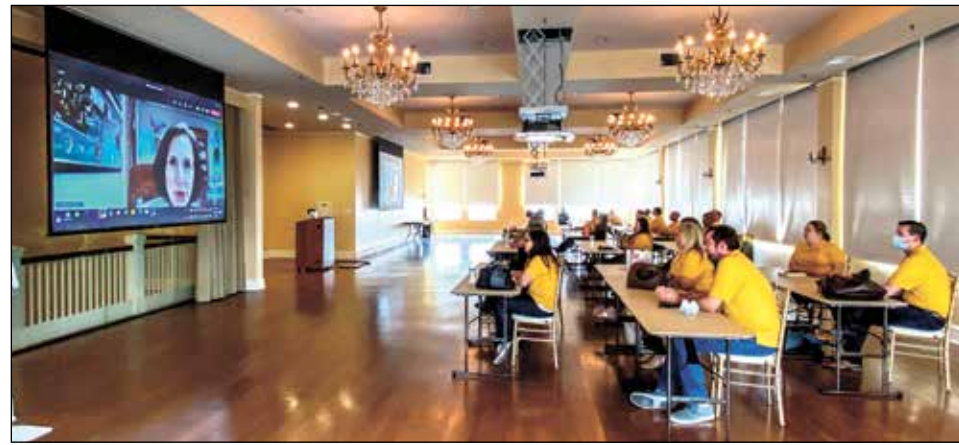
State Senator Lois Kolkhorst