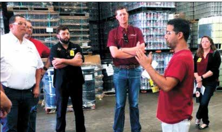
An employee of QuestSpecialty Corporation gives a tour of their warehouse.

The day ended with dessert...a trip to Blue Bell Creameries. They were able to view production from the observation deck and then to the ice cream parlor for a treat.