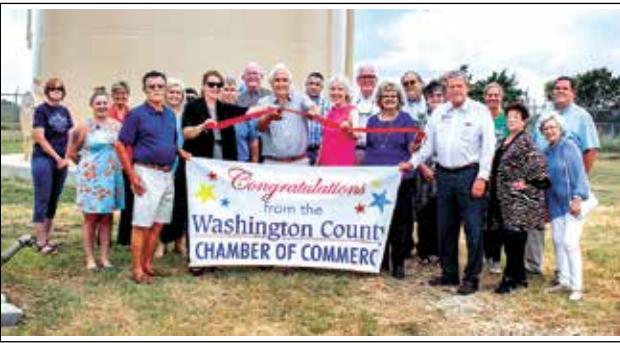
New Water Well