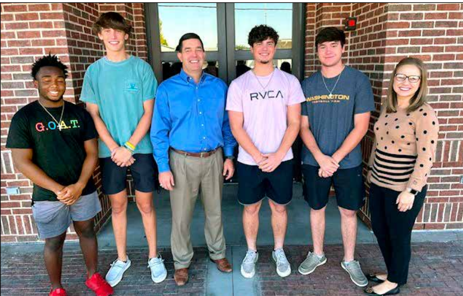
Bank of Brenham

Students help deliver resources and share the Value of the Month with local participating businesses.