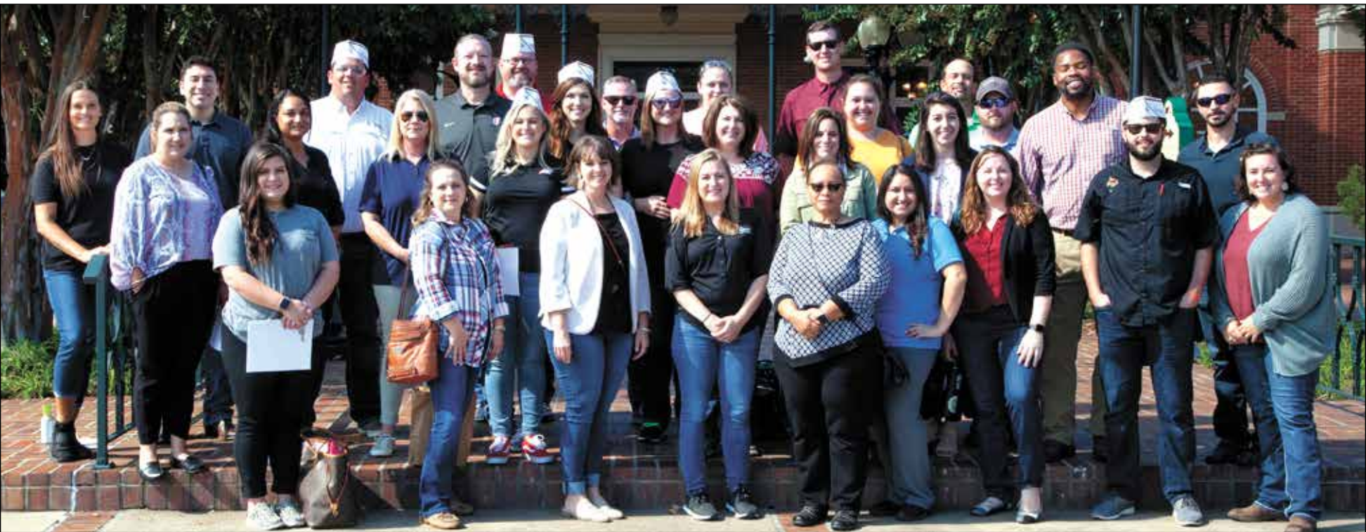
The class at Blue Bell Creameries.