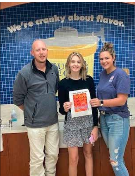
Blue Bell Creameries