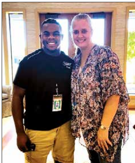
Thielemann Construction Co., L.P. & Stegent-Thielemann Plumbing