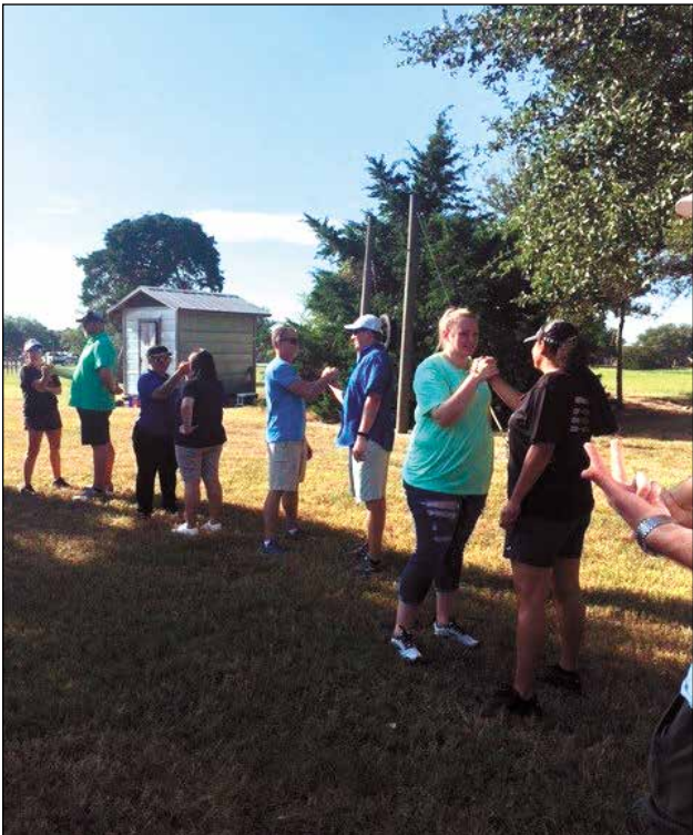
The class learned several different “handshakes” with different participants.