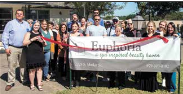
New Member & New Location