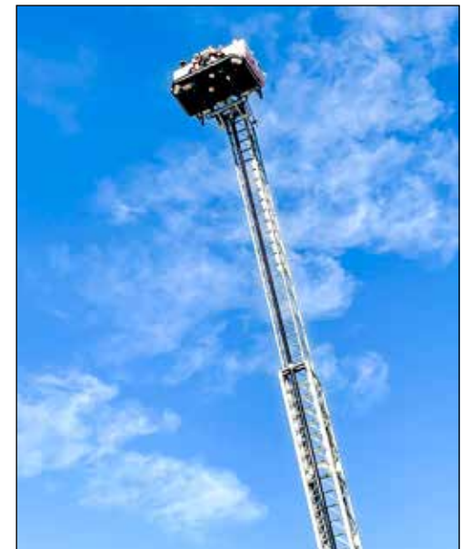
Those who were willing were able to take a ride up the ladder.

The next class will form in July. For more details or to view the application form, visit the "Leadership" page on www.BrenhamTexas.com .