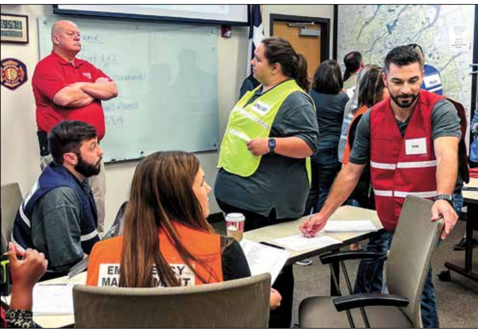
The class steps into various roles as they try to conduct a plan for a mock disaster that has occurred in town.