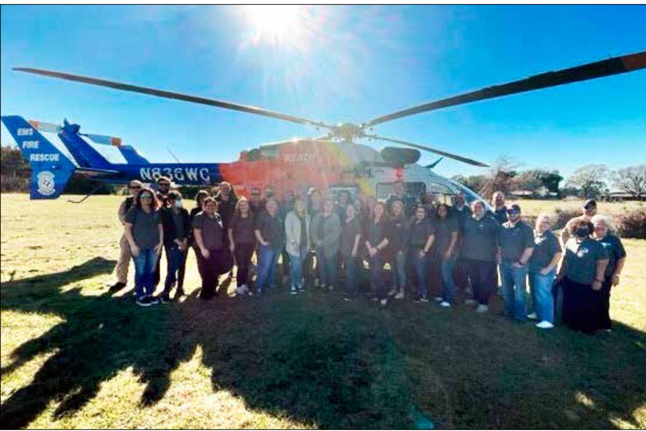
Class photo with the EMS copter.