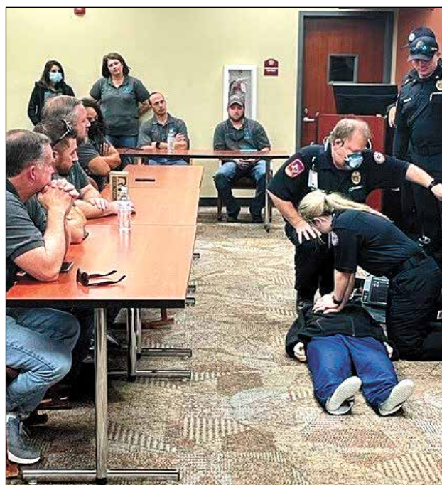
Paramedics demonstrate the LUCAS procedure on a mannequin.