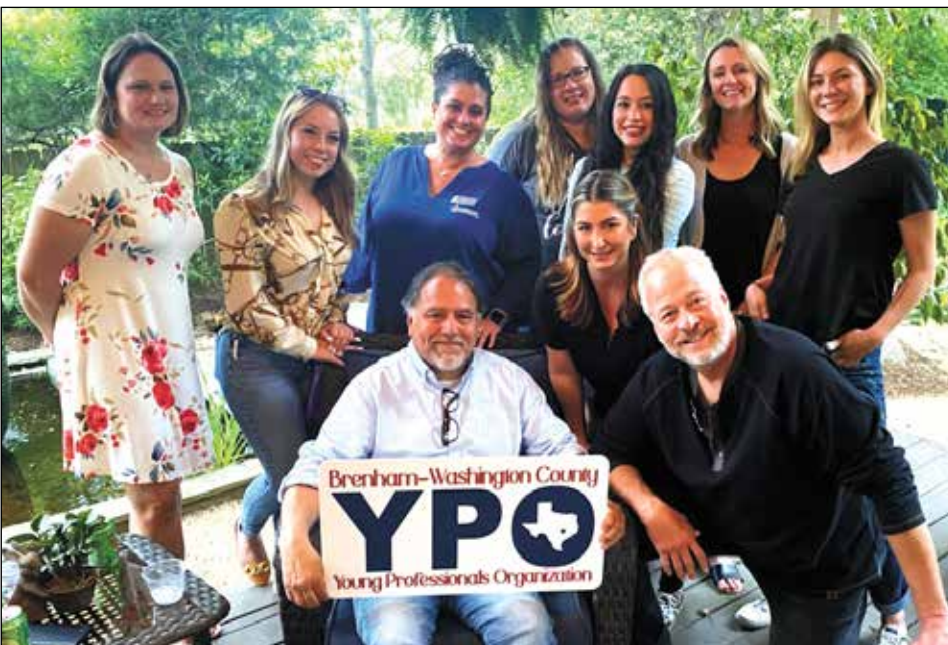
YPO April Networking Happy Hour at Thyme Day Spa