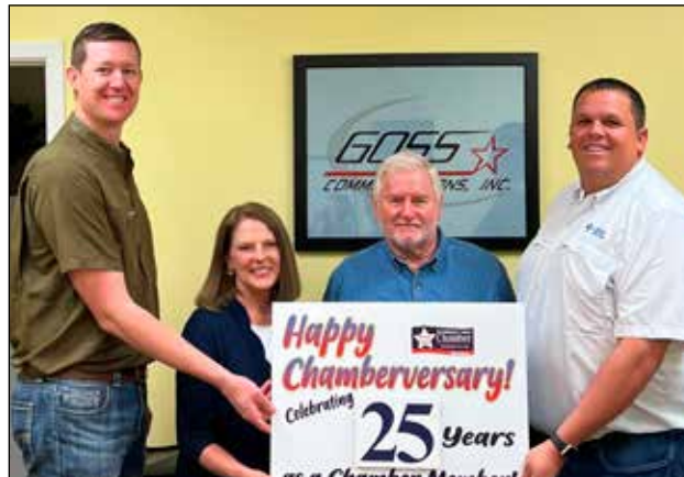
Goss Communications 25 years