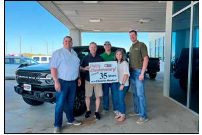
Appel Ford 35 years