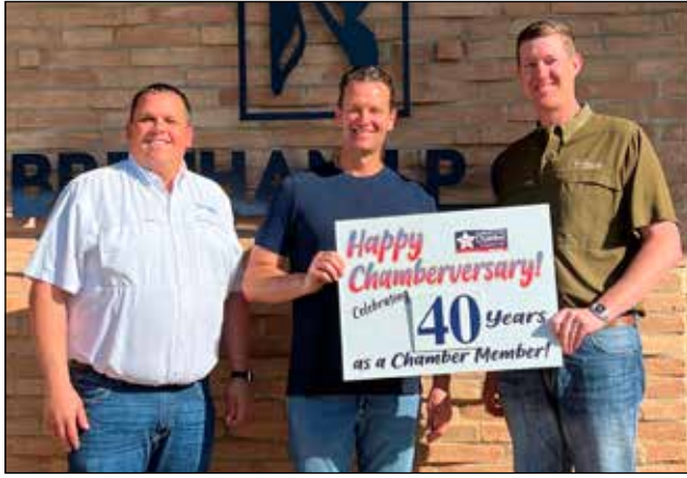
Brenham LP Gas 40 years