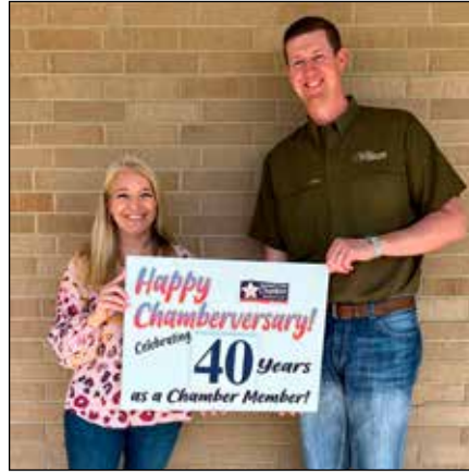
Brenham Maifest 40 years