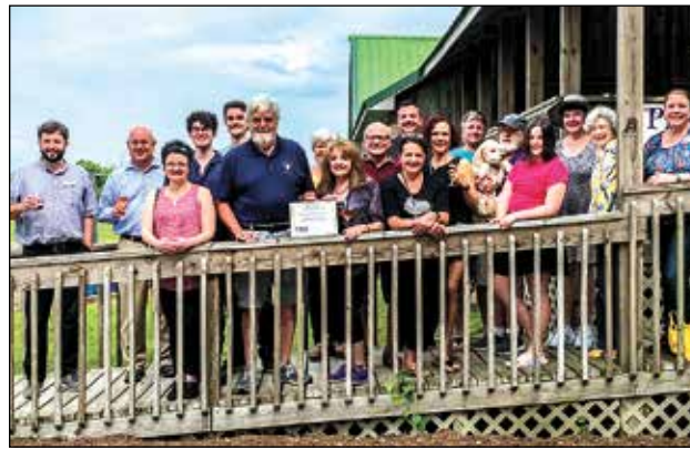
25th Anniversary - Celebration