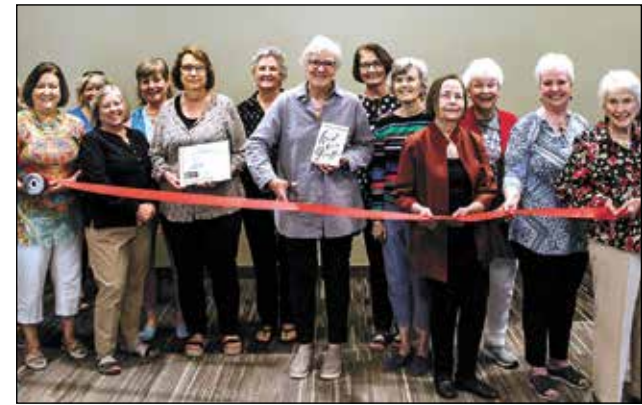
Announcement of the 2022 Read Book