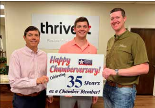
Thrivent 35 years