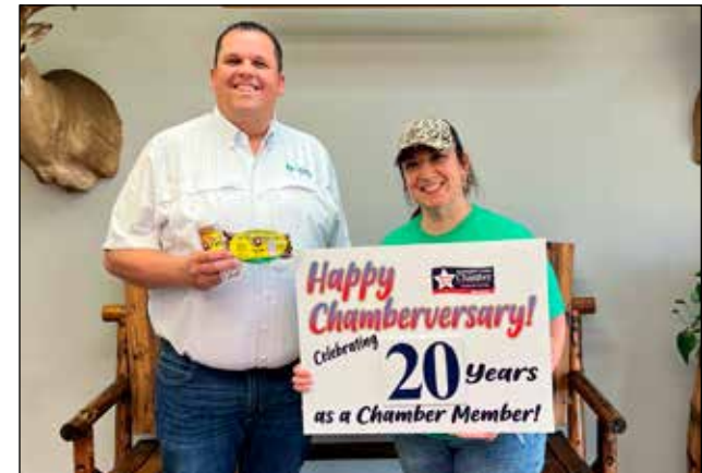
Kountry Boys Sausage 20 years