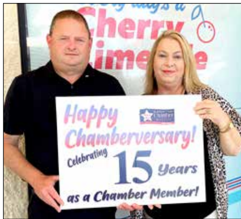
Sonic 15 years