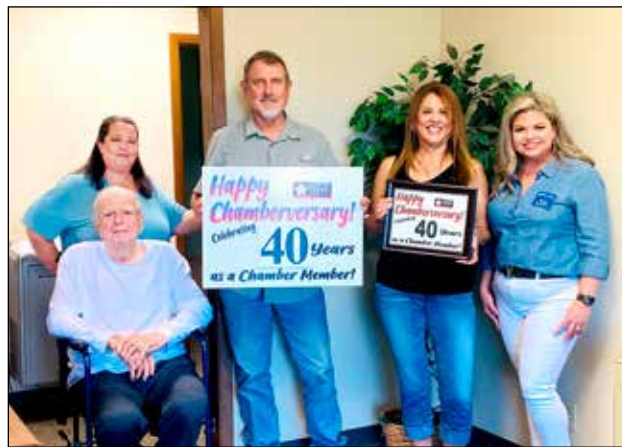
R & S Leasing 40 years