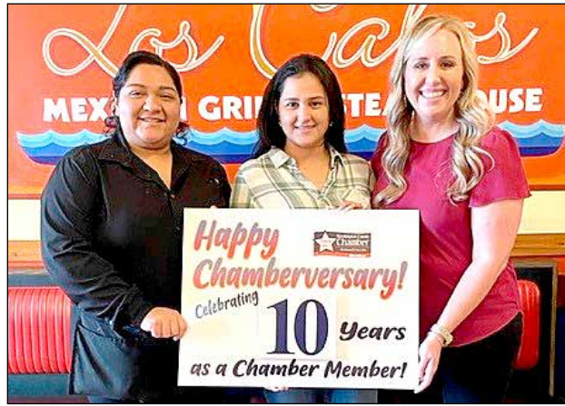
Los Cabos 10 years