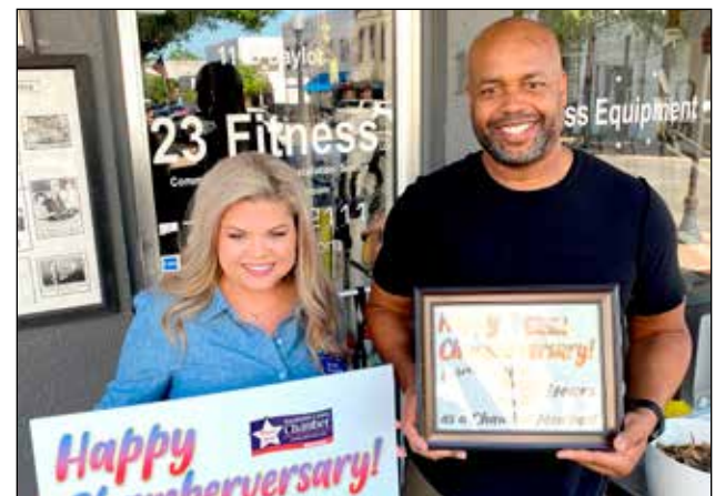
23 Fitness 5 years