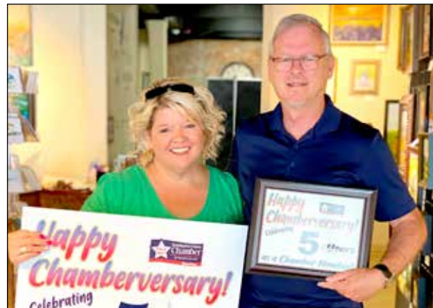
Tegg Art Studio 5 years