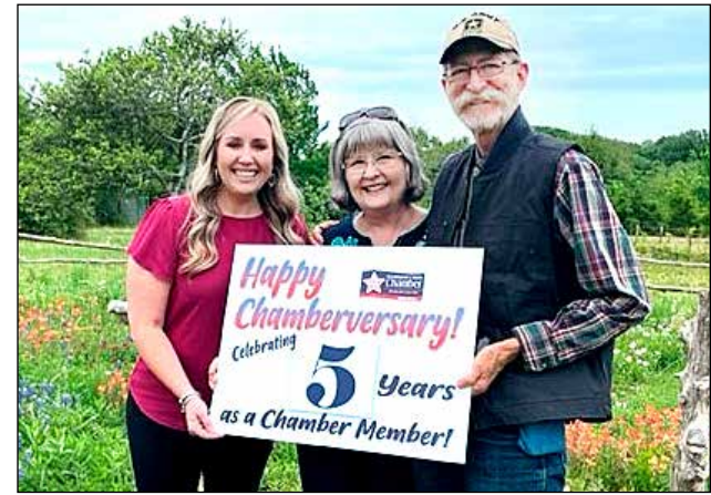
Cottages of Winedale 5 years