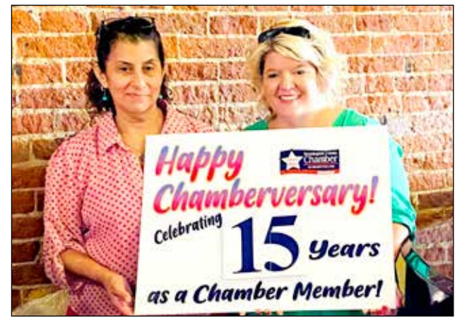
BT Longhorn Steak House 15 years