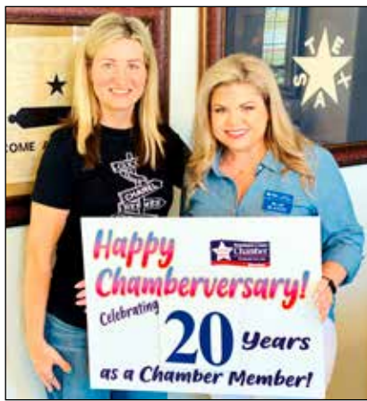
Brenham Insurance Center 20 years