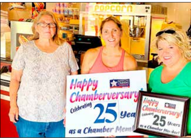
Westwood Cinema 25 years