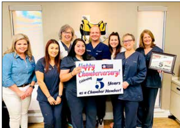
Tippit Dental Group 5 years