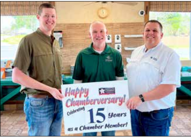
Computer Helpers 15 years