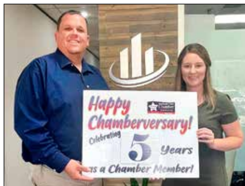
SVN | Riverstone Commercial Real Estate 5 years